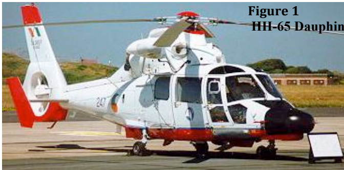
Figure 1 HH-65 Dauphin

the amphibious tiltrotor could have done an incredible and efficient job in rescuing these people because it has that added capability to land on water. One helicopter, “the HH-65 Dauphin”(“Aerospatiale / Eurocopter”), was a helicopter used quite frequently in the search and rescue missions (see “fig. 1”)(“Aerospatiale / Eurocopter 365/565 Dauphine EC155 Panther.”). Its cruise speed is about 173 mph and has a range of about 547 miles. It