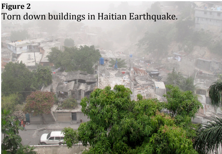
Figure 2 Torn down buildings in Haitian Earthquake.

the trapped people are bound to be dead in that amount of time without food and water.